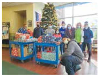
St. John Catholic School in Fenton dropped off their annual gifts!