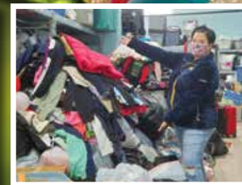
University of Michigan Flint Winter Wear Drive