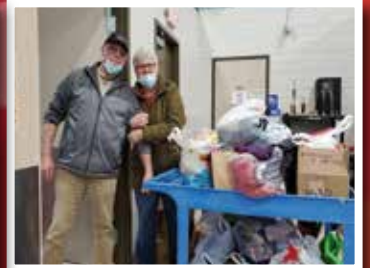
Stashing and Bill, longtime volunteers, brought donations in from friends in Howell.