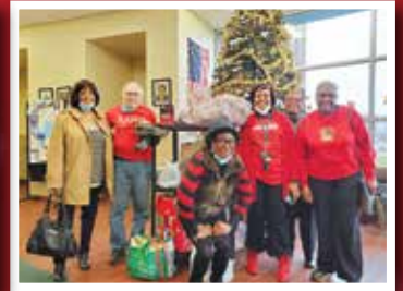
Local AARP members delivered Christmas gifts and then hung out for a tour!