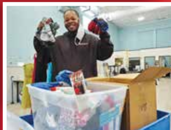
Our friends at Evangelistic Temple Church Apostolic Ministries donated lovely winter wear.