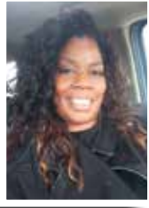
Homeless but not Hopeless (continued from page 3)

homeless face enormous obstacles. We see people all the time who are experiencing homelessness or are at risk of becoming homeless through no fault of their own."