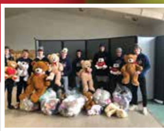
Powers Catholic High School Hockey Team